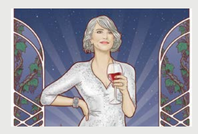
Georgetown Swirl MARCH 2

Enjoy an evening of shopping, wine and live jazz music March 2 from 6 to 9 p.m. at the 10th annual Georgetown Swirl. The cost is $50 per person. VIP tickets are $125 each with special benefits. Go to swirl.georgetown.org for details and tickets. Proceeds benefit the Main Street Facade and Sign Grant Program.