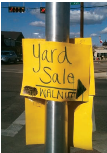
This is definitely not legal.

Residents holding a garage sale are allowed to put up signs to direct people to a sale. One sign can be placed on your property where the garage sale is to be held, and with the permission of the other property owners, up to two signs may be placed on private property not more than 1,000 feet from your house. Garage sale signs should not exceed four square feet and no attachments to signs are allowed, such as balloons or streamers.