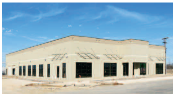
TLCC building 2 opens soon.

Summit at the Rivery: Plans for a 220-room Sheraton hotel and conference center on Rivery Boulevard were finalized this year. Construction is slated to begin this fall on the hotel and 16,000 square-foot conference center with completion by the end of 2015. Future phases of the project will include stores, restaurants, single-family homes, and multifamily residences for an estimated total project investment of $150 million.